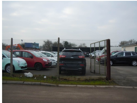
Photograph 22 – Unit 6 Access