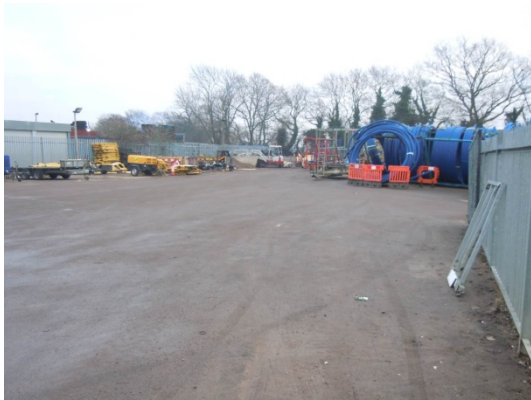
Photograph 3 – Site 1A