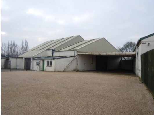
Photograph 13 – Unit 3A