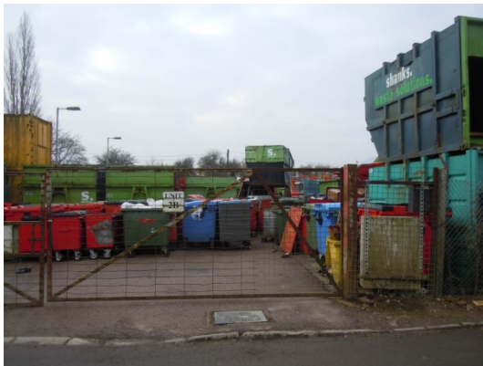
Photograph 9 – Site 2B