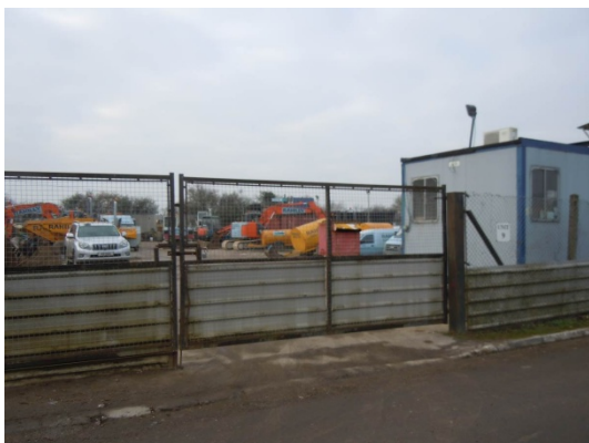
Photograph 23 – Unit 9 Access