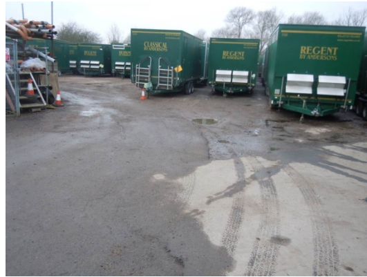
Photograph 20 – Unit 5 Site