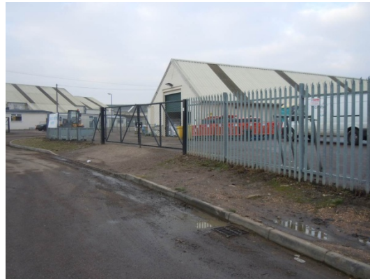
Photograph 4 – Entrance into Site 1A