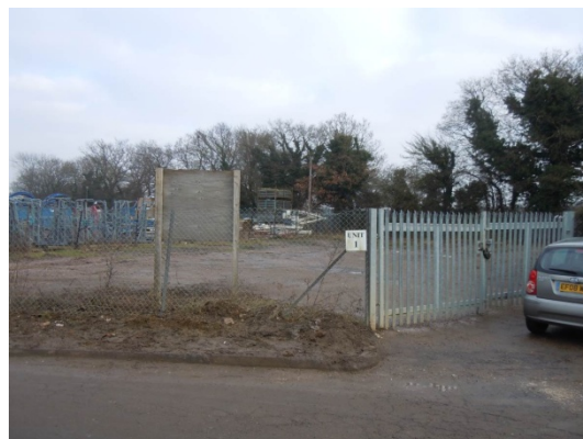
Photograph 6 – Access to Unit 1C