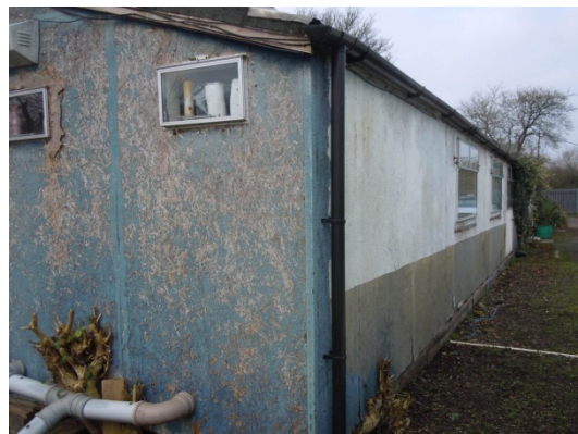
Photograph 18 – Unit 5 Building