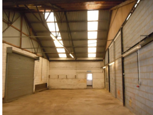
Photograph 14 – Unit 3A Interior.