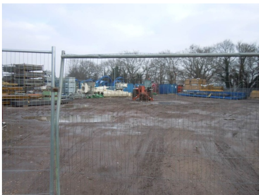
Photograph 5 Site 1B