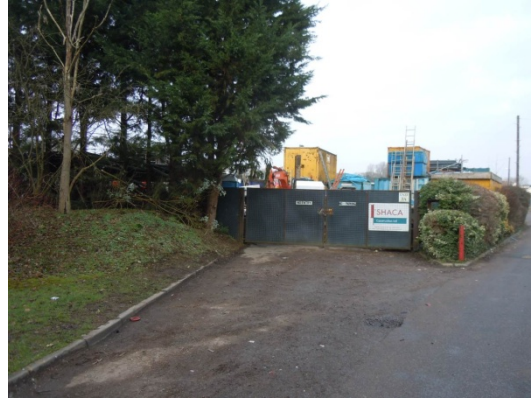
Photograph 8 – Access to Site 2A