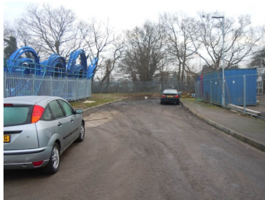
Photograph 28 – Access Road