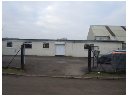
Photograph 10 – Unit 2E