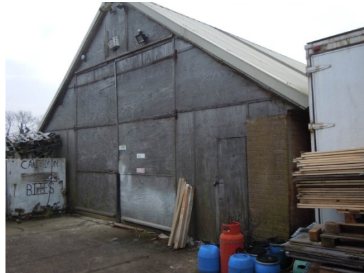
Photograph 16 – Unit 4 Building