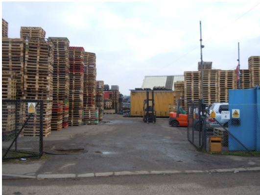
Photograph 15 – Unit 4 Access