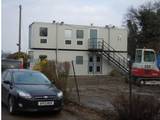
Photograph 7 – Site 1D