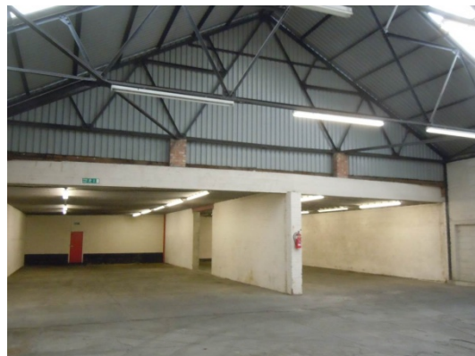
Photograph 12 – Unit 3 Interior