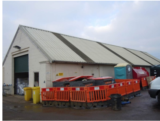
Photograph 2 – Building to 1A