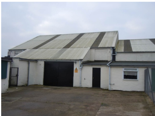
Photograph 11 – Unit 3