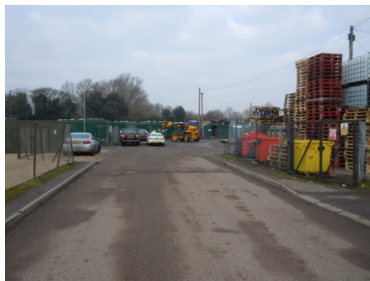
Photograph 30 – Access Road