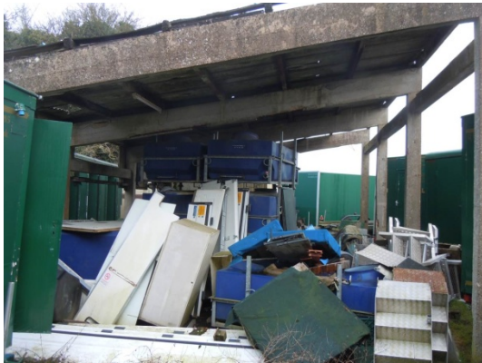
Photograph 21 – Unit 5 Structure