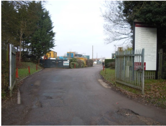
Photograph 1 – Main Entrance into Site