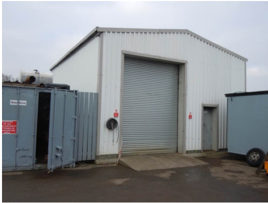
Photograph 25 – Unit 11 Building