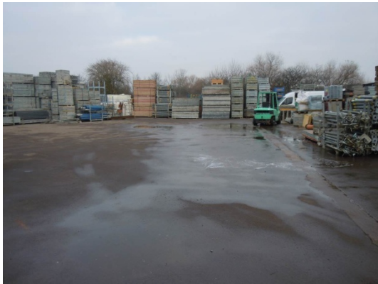
Photograph 27 – Unit 15