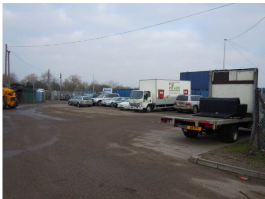
Photograph 31 – Access Road