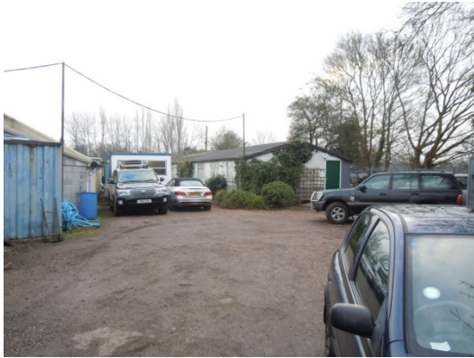
Photograph 19 – Unit 5 General Area