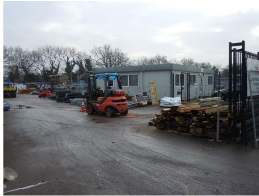
Photograph 26 – Unit 10B Building