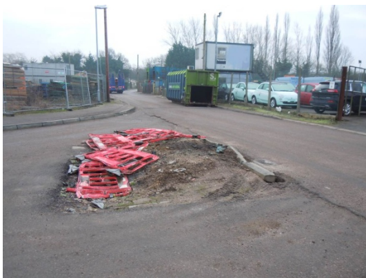
Photograph 29 – Access Road