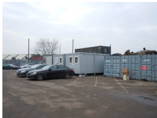
Photograph 24 – Unit 11 Building