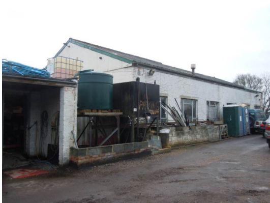
Photograph 17 – Unit 5 Main Building